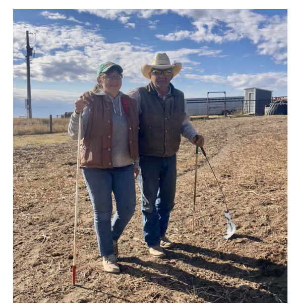
The two "Lovebirds" ready to wean calves.

Homozygous Black. Polled. Wow, what a set of numbers he has. He weaned off the heaviest at weaning. He will give you pounds at weaning & still make you a hell of a set of replacements.