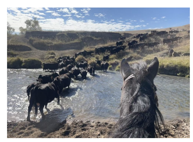
The best view rounding up the cows is the view on horseback. (Skye & her horse Arie rounding up the river cows to wean calves)